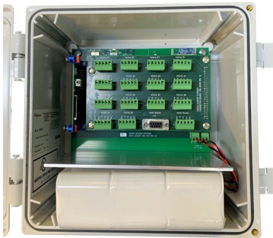
Inside Data Logger Enclosure

Enclosures Hinged Polyester Type 4X UV Resistant Approximate Size 4"x8"x8" For detailed dimensions see Hoffman P/N A884PHC.